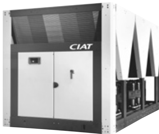
LDC - ILDC 1400V - 1500 V models